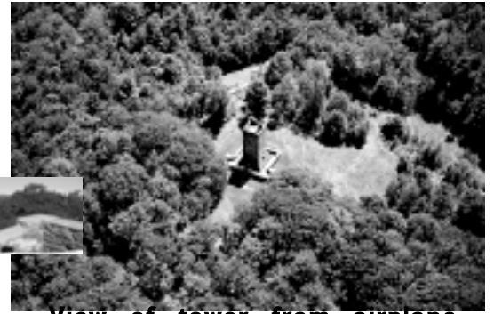
View of tower from airplane

Friends of Montpelier Parks 39 Main St Montpelier, VT 05602 geoffbeyer@vtlink.net 223-7335