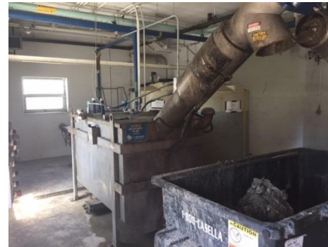
Solids Receiving Equipment